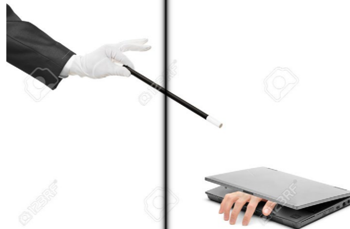
While they ensure the unobstructed circulation of goods, they themselves are withheld from circulating.