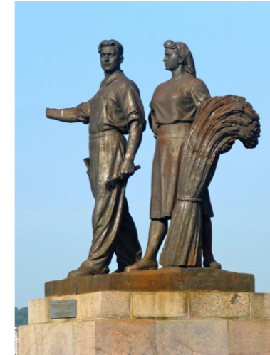
They labor hard to develop the most efficient and unintrusive market control mechanisms.